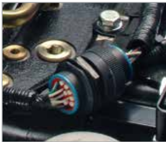
IP66 Sealed Connector