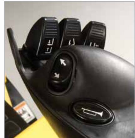
Seatside Directional Control