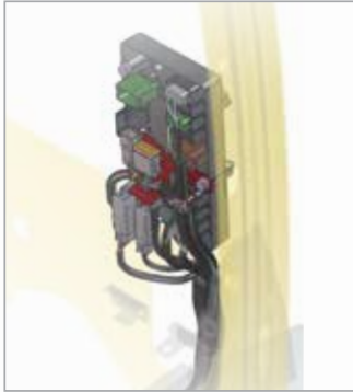
VSM Industrial Computer

Industrial lift truck downtime results from problems with the powertrain, electrical system, cooling system or hydraulic system. Advanced design of the H40-70FT truck series has reduced downtime by up to 30%. In addition, the Hyster® dealer network is able to respond swiftly to any downtime reported and provide a quick service solution. Furthermore, the Fortis® truck series offers excellent service access to allow for easy maintenance. Together these factors assist you in maintaining maximum productivity in your operation.