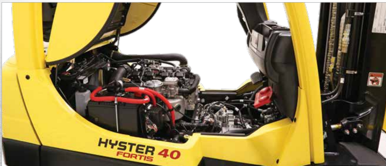
PSI 2.4L LPG Engine