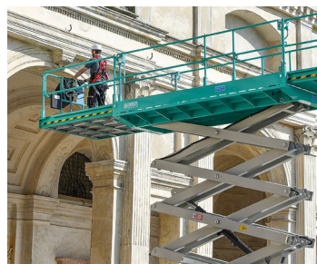
Driveable at full height and fully extended