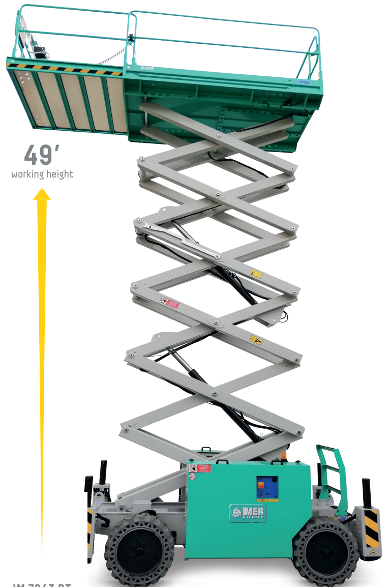
IM 7043 RT