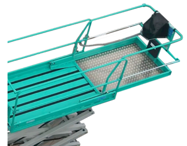
Manual deck extension of 59" 1100 lb Capacity (Stabilized) Number of Occupants - 4