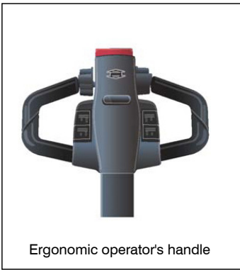
Ergonomic operator's handle