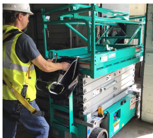
Narrow platforms and foldable guardrails allow for easy access through standard doorways