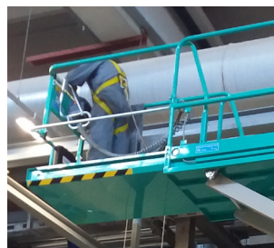
Driveable at full height and fully extended